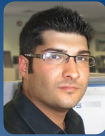
Senior Java Developer