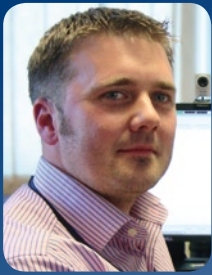
Senior Principle Architect