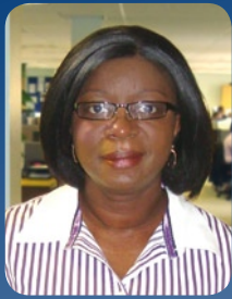
Senior Test Analyst